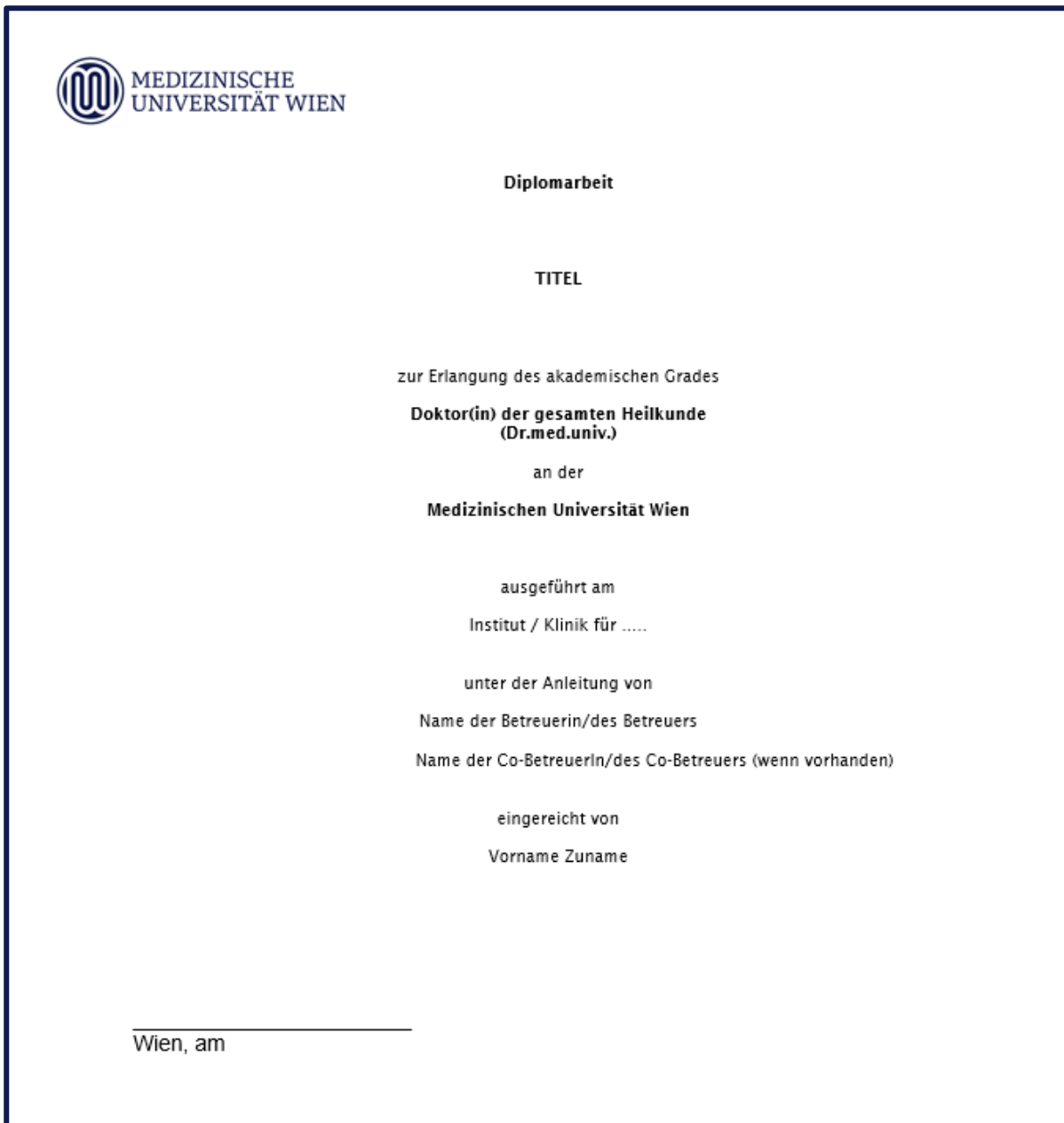
Figure 2: Cover page template